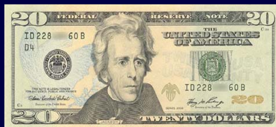
U.S. Dollar Note