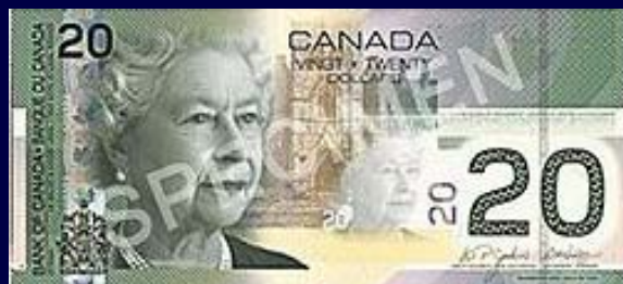
Canadian Dollar Note