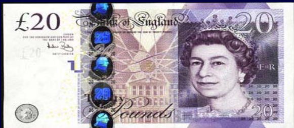
British Pound Note